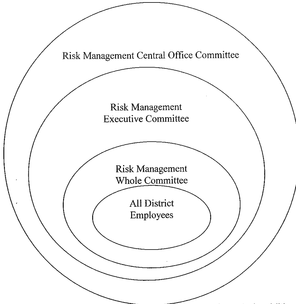
Figure 3.2.4: District Employee Participation in Risk Management Program

Accordingly, all District employees shall be expected to perform their additional duties in accordance with this Risk Management Program, and the job description of every employee position is hereby revised to include the extra duties and responsibilities required to fully implement and evaluate the risk management components of this Risk Management Program.