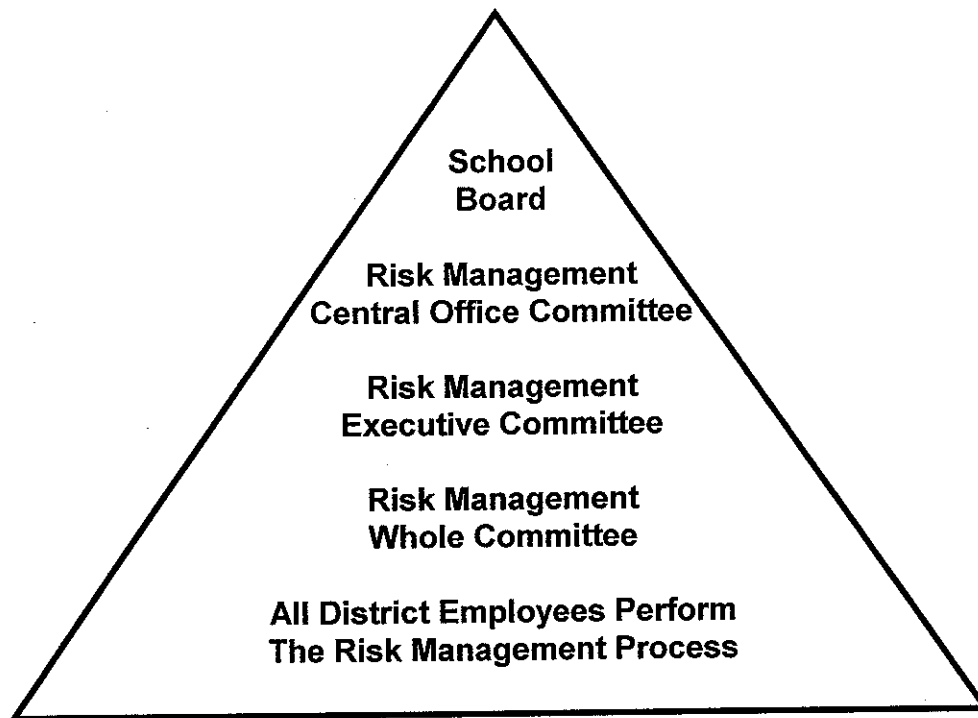
Figures 3.2: Risk Management Organization

The Risk Management ("RM") Central Office Committee should oversee, coordinate, and assign responsibilities for implementing this Risk Management Program, and shall report to the School Board. The RM Executive Committee should develop the overall risk management analytical framework, and shall report to the RM Central Office Committee. The RM Whole Committee should implement the performance of the Risk Management Process by all District employees, and shall report to the RM Executive Committee. All levels of employees have a duty to perform the four steps of the Risk Management Process for those areas over which they have responsibility and to report on their findings and recommendations. Figure 3.2 illustrates the risk management organization.