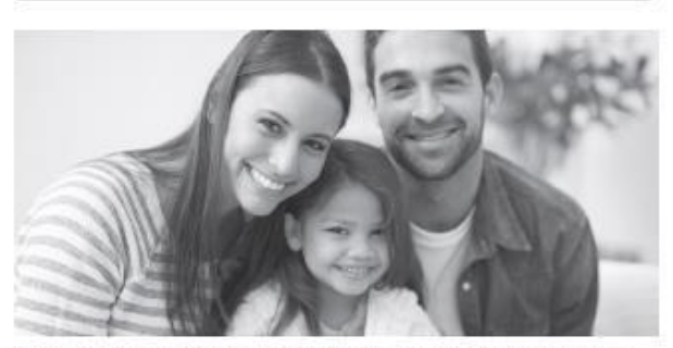
If you were suddenly faced without a paycheck, would you be fully prepared? Could you afford your expenses while maintaining your current lifestyle?

One of the most important assets a person possesses is the ability to earn an income. Disability Income Insurance from American Fidelity is a cost-effective solution designed to help protect you if you become disabled and cannot work due to a covered injury or sickness.