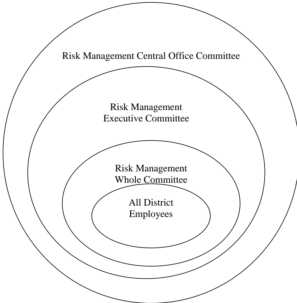
Figure 3.2.4: District Employee Participation in Risk Management Program

Accordingly, all District employees shall be expected to perform their additional duties in accordance with this Risk Management Program, and the job description of every employee position is hereby revised to include the extra duties and responsibilities required to fully implement and evaluate the risk management components of this Risk Management Program.