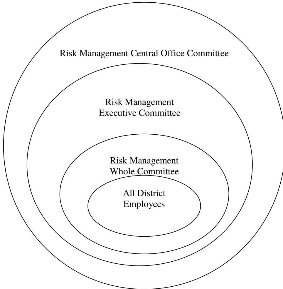
Figure 3.2.4: District Employee Participation in Risk Management Program

Accordingly, all District employees shall be expected to perform their additional duties in accordance with this Risk Management Program, and the job description of every employee position is hereby revised to include the extra duties and responsibilities required to fully implement and evaluate the risk management components of this Risk Management Program.